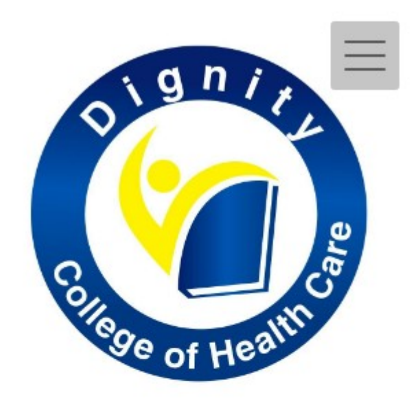
Dignity College of Healthcare